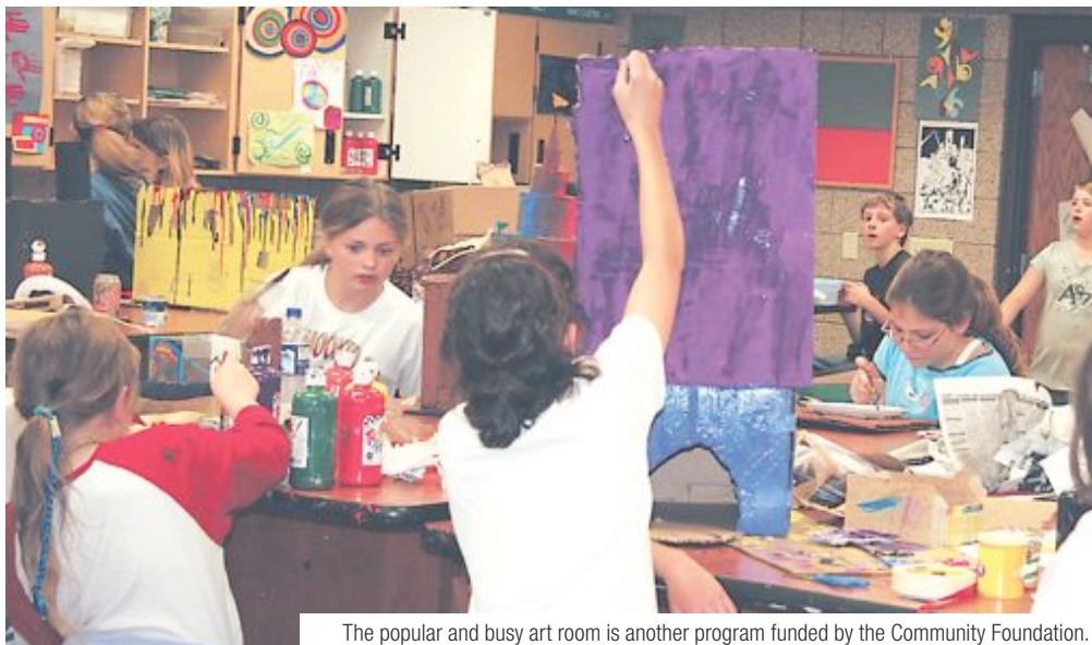
The popular and busy art room is another program funded by the Community Foundation.

the best way to show our appreciation is to continue to deliver on our mission in Wausau and throughout our area. The Club has grown tremendously – from less than 200 to over 1,800 members – since the Foundation started investing in our organization and with their continued support, as well as others throughout the community, we will serve thousands more kids with life-changing impacts.” ■