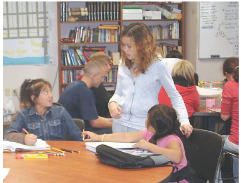
Club members at Power Hour have access to the computers, printers, supplies and tutors for homework help.

Power Hour is part of the Club's Learn, Lead, Succeed initiative, which gives members access to homework help, computer skills, job and career exploration, college preparation, and community service. ■